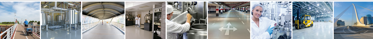
© copyright photography & illustrations: iesik aleksanar, rawpixei, yarruta, vanatcnanan, igor doigov, cseñ ioan, wavebreak media ita, kzenon, vadim ginzburg, konstanttin, wisnu naryo yuonanto